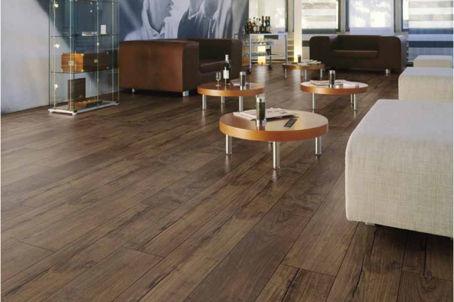
Nostalgie Teak - D 4170 ER