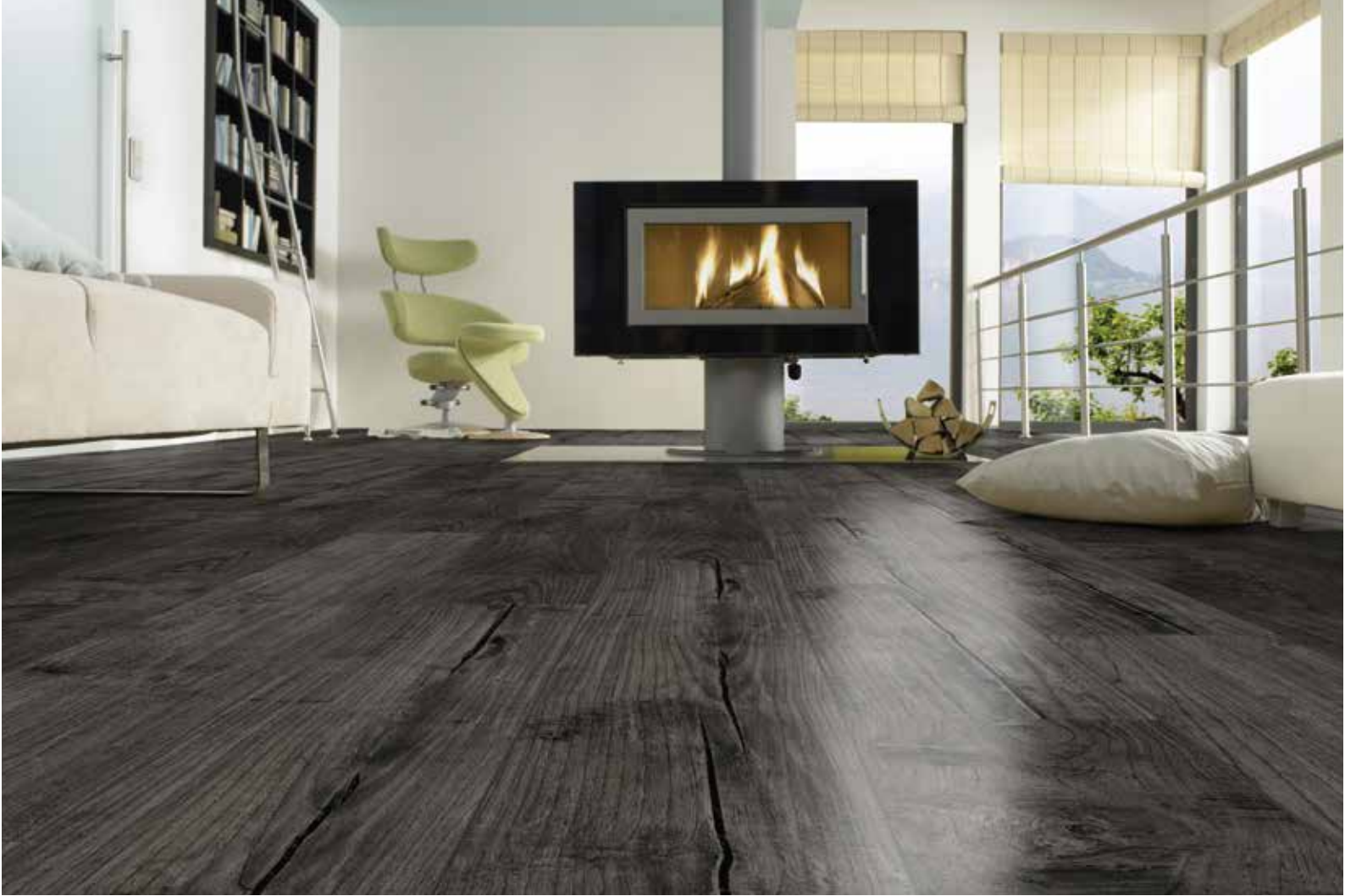
Nostalgie Teak Graphit - D 4171 ER