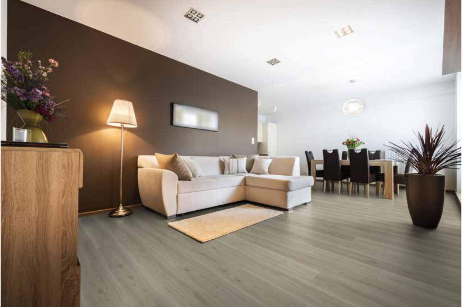
Sierra Oak Titan - D4688 ML