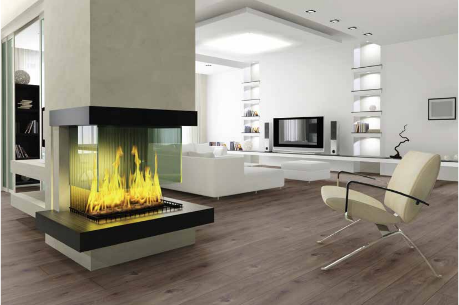
Prestige Oak Dark - D 4168 ER