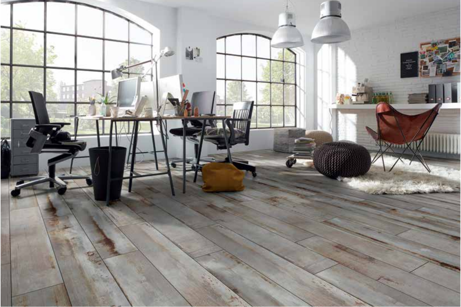
Used Metal - D 4801 ML