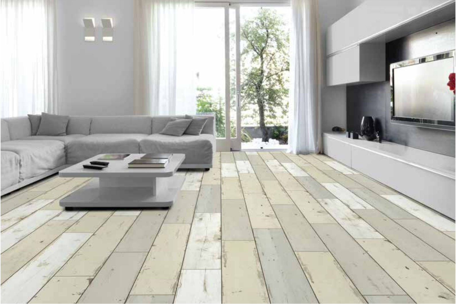
Brave - D 4782 UL